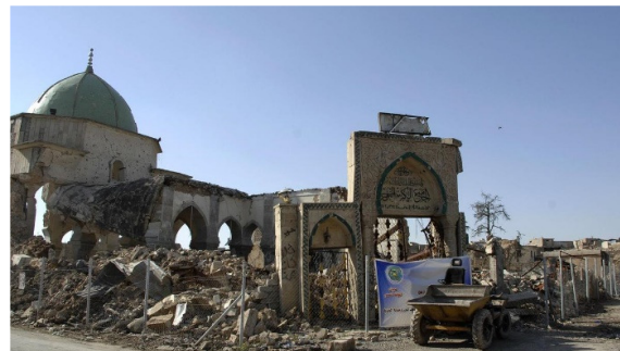
The Great Mosque of Al-Nouri