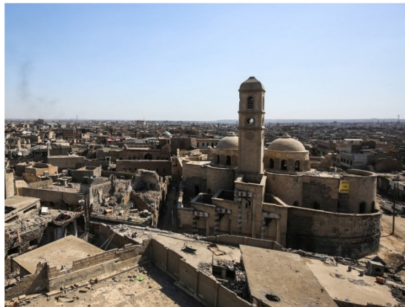
The Dominican church of Our lady of the Hour in 1980s (left) and now

The Great Mosque of al-Nouri was built in 1172-1173 by the Turkman Nur al-Din al-Zanghi of the Seljuk Empire, and destroyed in June 2017 by IS during the Battle for Mosul. It held symbolic importance to the extremists and to its leader Abu Bakr al-Baghdadi, who used it in 2014 to declare the self-styled "caliphate". According to Mosul's citizens, IS destroyed the mosque in order not to allow any other Imam other than Abu Bakr al-Baghdadi to give a sermon there.