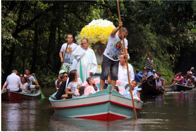
Pilgrims travel in boats as they accompany the statue of Our Lady of Nazareth during an annual river procession and pilgrimage along the Apeu River to a chapel in Macapazinho, Brazil, Aug. 3, 2014.

Since the early 1990s, some Buddhists have ordained trees, wrapping traditional orange cloths around them, to draw attention to deforestation, while those living in the Himalayan Mountains have networked to take steps to protect the local environment. Elsewhere in the Himalayas, the Chipko movement, especially prominent among Hindu women, began holding vigils in the early 1970s to stop logging in the region. And the Interfaith Rainforest Initiative today is a global effort to end tropical deforestation.