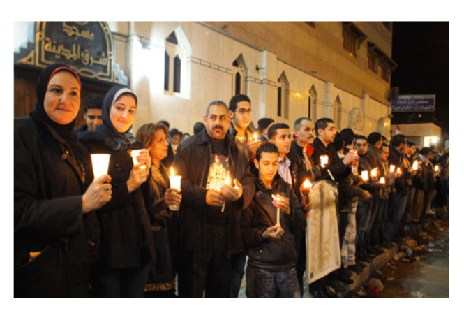
New Year 2012 – Muslims mourning the attack on a church in Alexandria one year earlier.