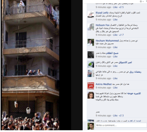
March 18, 2012 – Muslims providing water all day long to mourning Christians for the death of Pope Shenouda.

would have expected, but the Samaritan is our neighbor because he provided help to the man